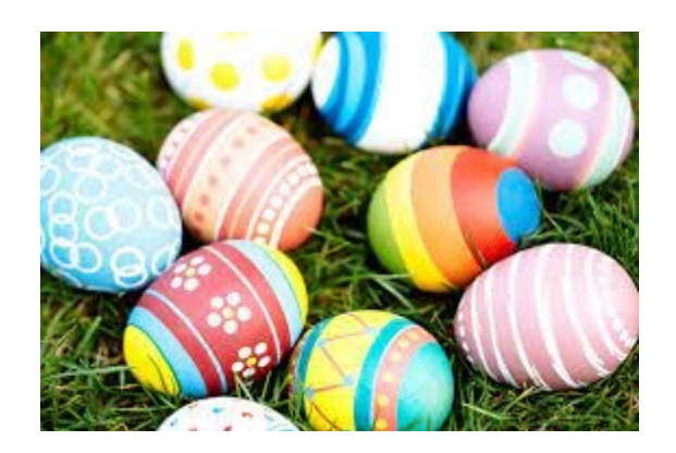
Lots of Easter Activities including Glitter Tattoos, Bingo and Egg painting