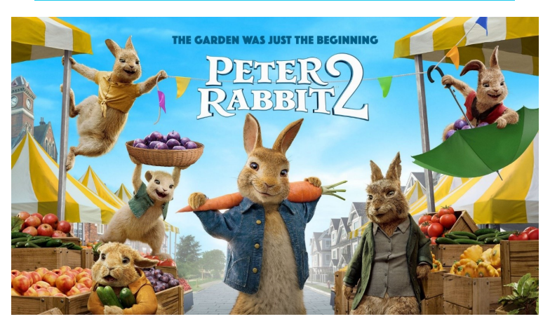
Thursday, 17<sup>th</sup> March - 3.30pm-5pm Popcorn and sweets provided!

Permission Slips coming home with children today! We hope to see the children there!